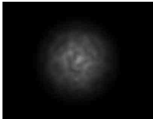
Light source output with Shaker