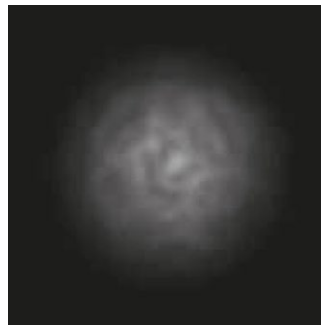
Light source output with Shaker