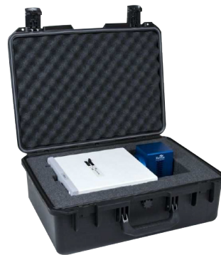
MPX-2 in Carrying Case (Optional)