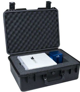
MPX-2 in Carrying Case (Optional)