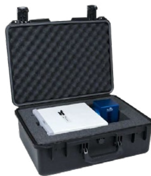
MPX-2 in Carrying Case (Optional)