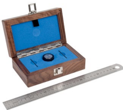
MPX Geometrical Calibration Artefact (Optional)