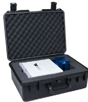
MPX-2 in Carrying Case (Optional)